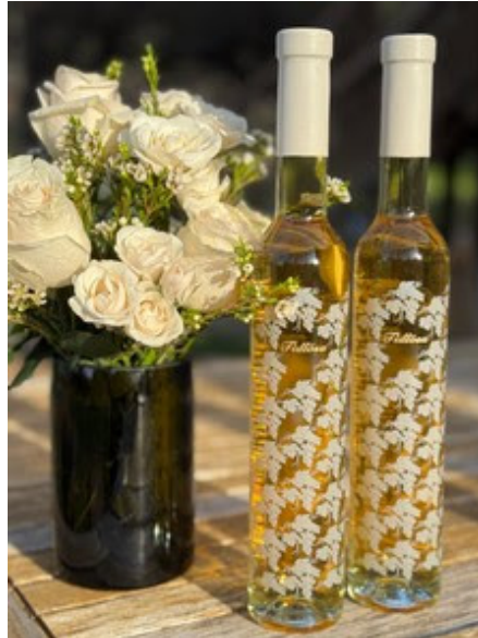
TIDLÖSA, a delicious dessert style wine, $150/375ml bottle

Email info@andersonconnvalley.com to order!