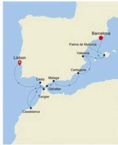
BARCELONA TO LISBON