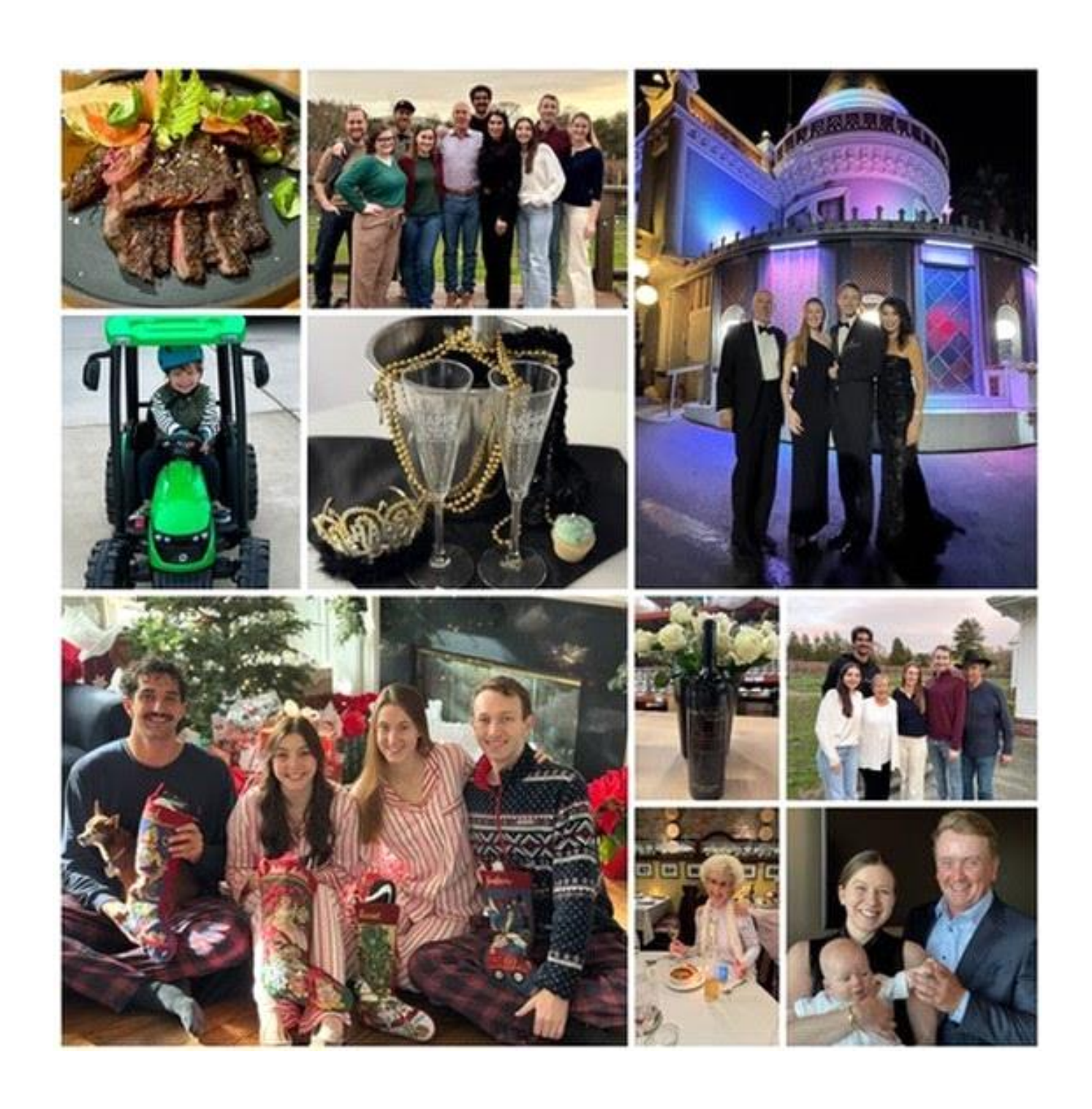
☀ Winery Schedule ☀