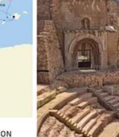
BARCELONA TO LISBON