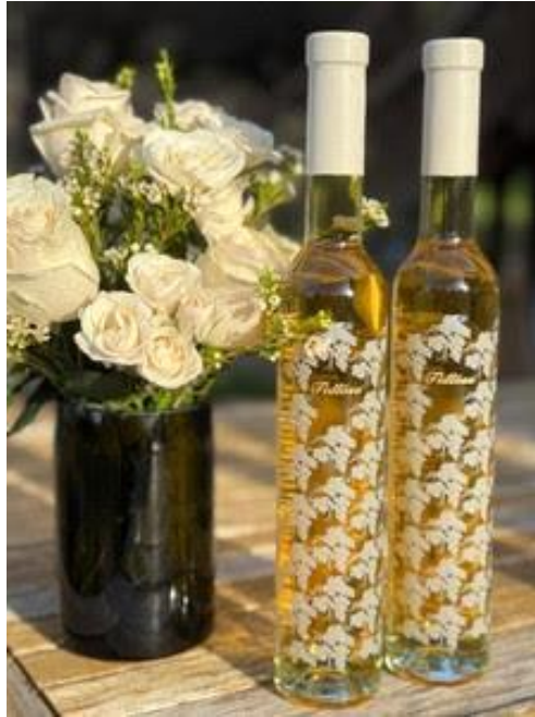
TIDLÖSA, a delicious dessert style wine, $150/375ml bottle