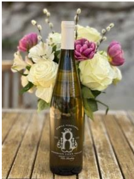
2024 RIESLING, a wonderful fresh white, fermented dry and stunning! $78/bottle