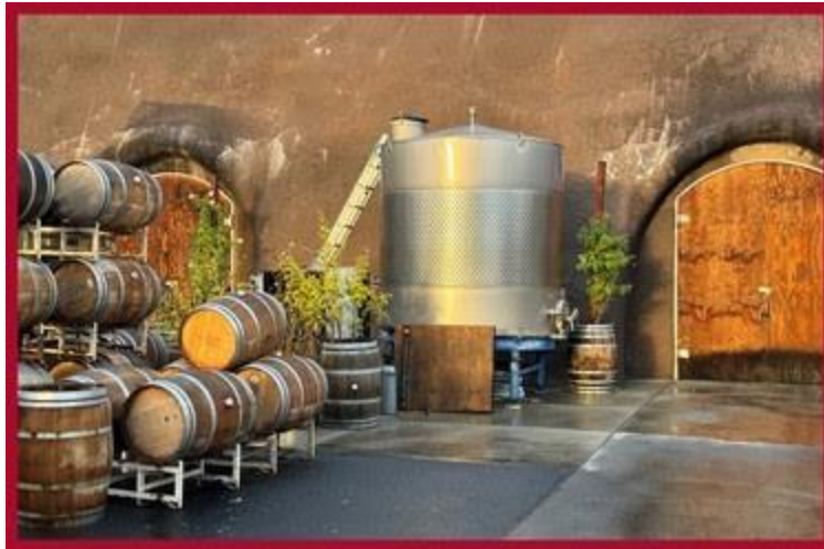
(A rainy day at the vineyard)

Whether looking for a personalized Corporate Gift, a unique Birthday gift, wine for weddings, parties, gift baskets or special clients, we have the perfect wine for you! Custom etch your logo or a special message on any of our beautiful bottles. Call Sarah at (707) 963-8600 or email info@andersonconnvalley.com and we will be happy to share options and ideas to create something special!