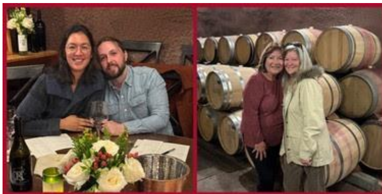
(Club Members enjoying a tasting in the cave!)