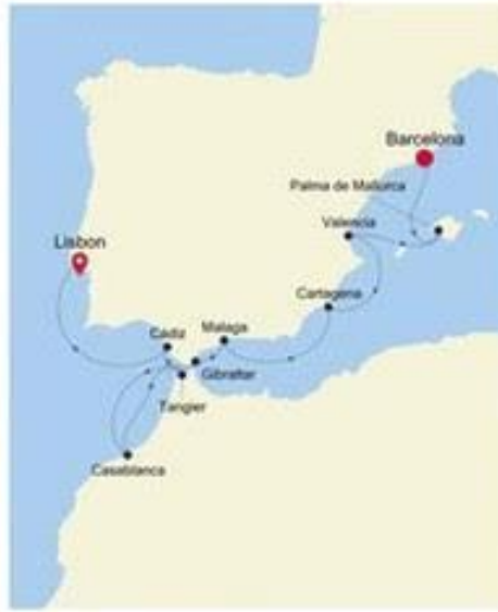
BARCELONA TO LISBON