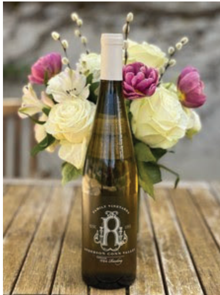
2024 RIESLING, a wonderful fresh white, fermented dry and stunning! $78/bottle (nearly sold out!)