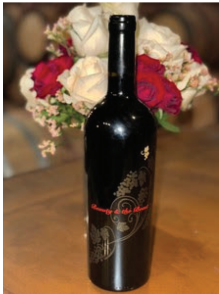
BEAUTY & the BEAST, a beautiful big Cabernet-Syrah blend! $258/bottle (nearly sold out!)