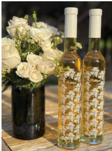
TIDLÖSA, a delicious dessert style wine! $150/375ml bottle