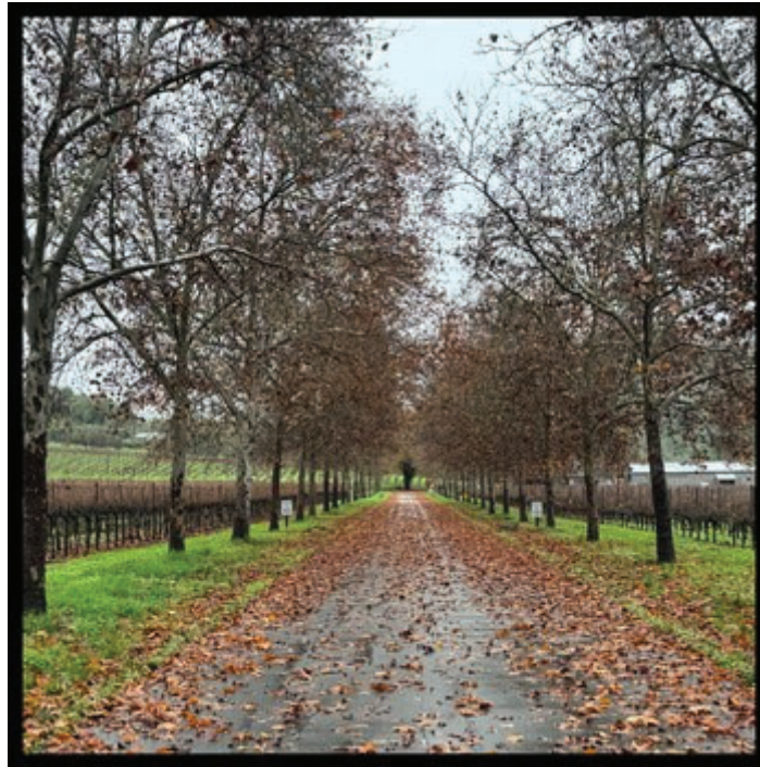
(Another beautiful rainy day at the vineyard!)

Whether looking for a personalized Corporate Gift, a unique Birthday gift, wine for weddings, parties, gift baskets or special clients, we have the perfect wine for you! Custom etch your logo or a special message on any of our beautiful bottles. Call Sarah at (707) 963-8600 or email info@andersonconnvalley.com and we will be happy to share options and ideas to create something special!