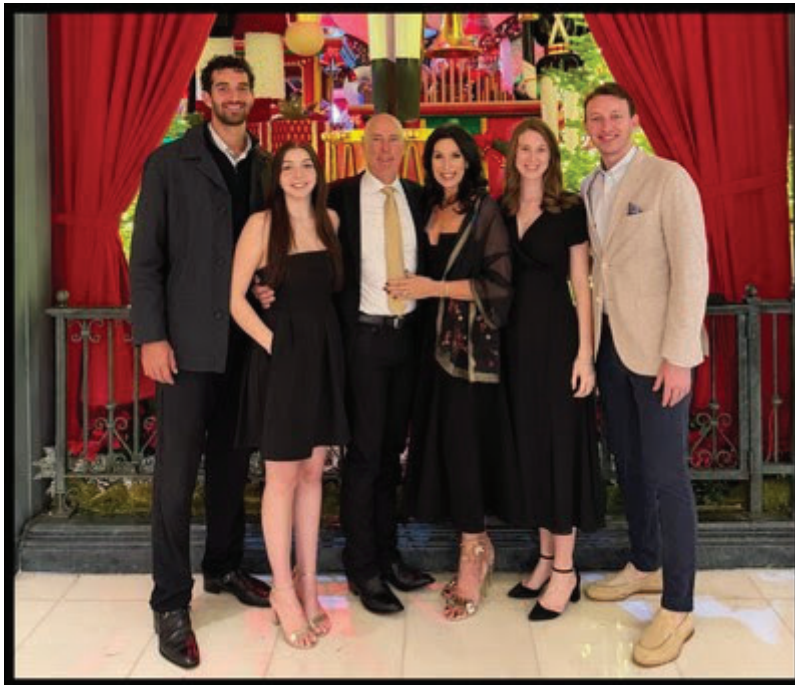
(Las Vegas Family Photo!)